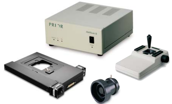
3 Axis system for both upright and inverted microscopes